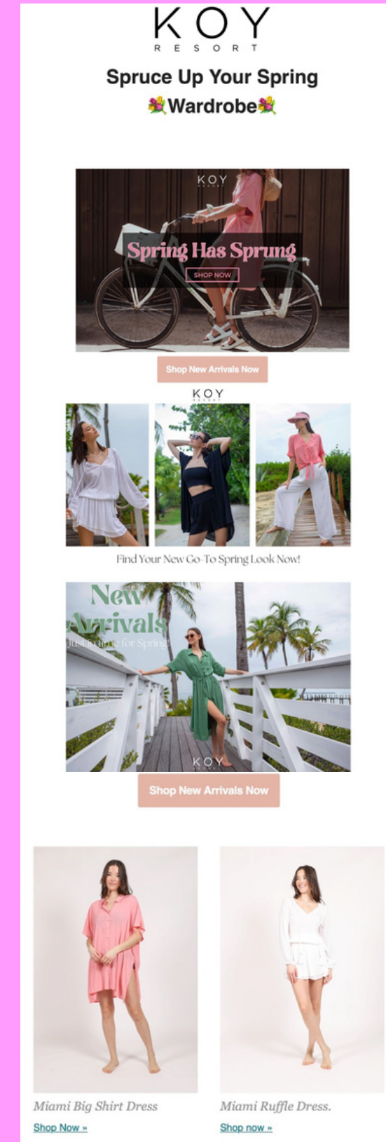
Example of newsletter for B2C