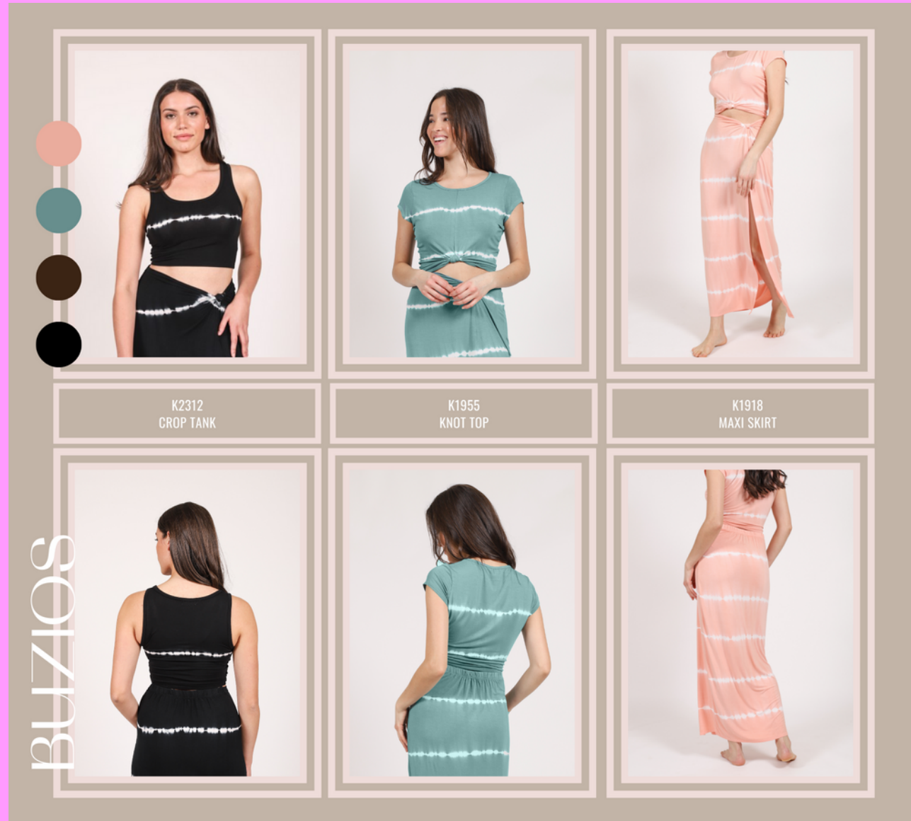
Example of sales tool created to open new accounts including HBC and Sportschek