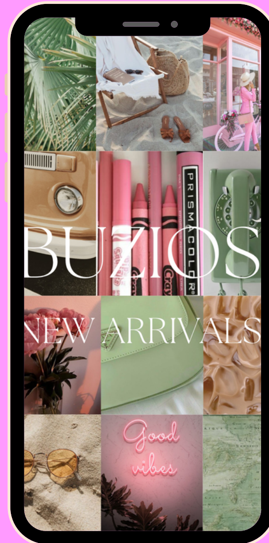
Mood board for new collection and campaign